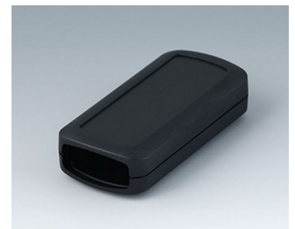
B2823109 CONNECT S ASA+PC (UL 94 V-0) black RAL 9005 3.54"x1.65"x0.87"