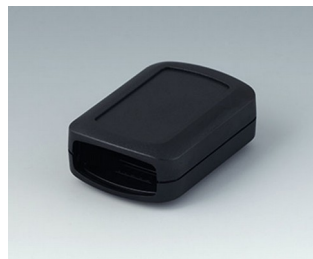
B2822109 CONNECT S ASA+PC (UL 94 V-0) black RAL 9005 2.36"x1.65"x0.87"