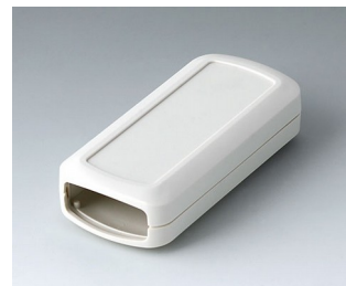
B2823107 CONNECT S ASA+PC (UL 94 V-0) off-white RAL 9002 3.54"x1.65"x0.87"