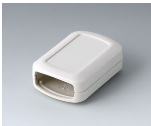
B2822107 CONNECT S ASA+PC (UL 94 V-0) off-white RAL 9002 2.36"x1.65"x0.87"