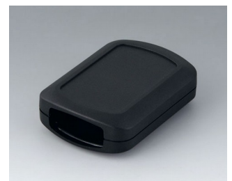
B2832109 CONNECT M ASA+PC (UL 94 V-0) black RAL 9005 2.99"x2.13"x0.87"