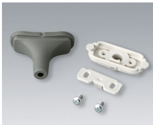
B2911318 Cable gland kit, 0.165" - 0.197" TPE volcano